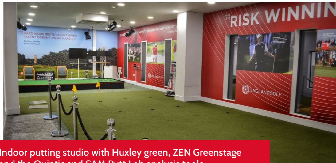
Indoor putting studio with Huxley green, ZEN Greenstage and the Quintic and SAM Putt Lab analysis tools.