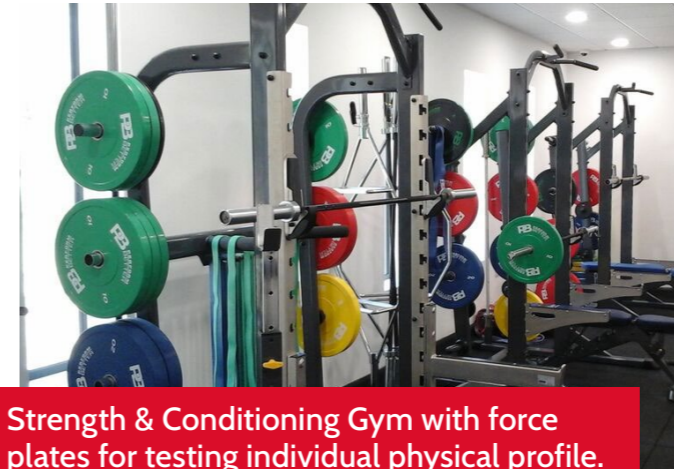
Strength & Conditioning Gym with force plates for testing individual physical profile.

The National Golf Centre offers two world class golf courses one of which, the Hotchkin Course, ranks 61st in the World. The National Golf Centre also has state of the art practice facilities used by England Golf and many touring professionals.