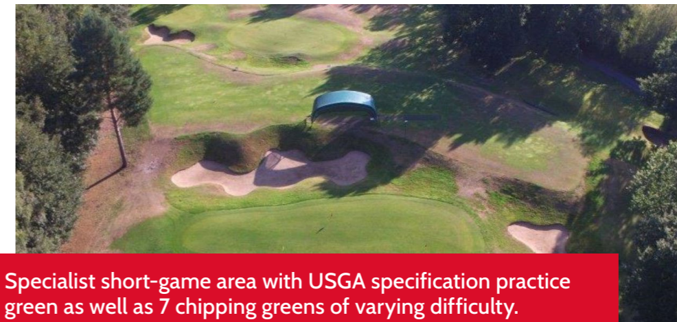
Specialist short-game area with USGA specification practice green as well as 7 chipping greens of varying difficulty.