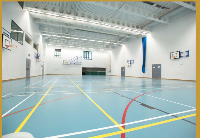
*Independent Schools of the Year 2022 Shortlist (Sporting Achievement)