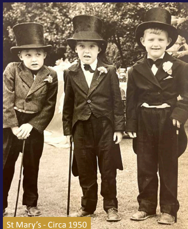
St Mary's - Circa 1950