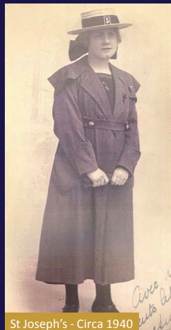
St Joseph's - Circa 1940