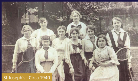
St Joseph's - Circa 1940

The roots of Lincoln Minster School and its predecessors reach as far back as the 12th Century. The School was born of an amalgamation of long-established and highly esteemed educational institutions (including the Lincoln Cathedral School), with many of the original historic listed buildings still in use by the School today.